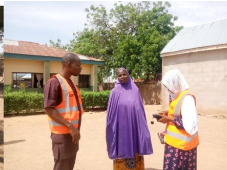
SUFABEL CAT team conducting CEI at Tsohon loko PHC facility temporary site