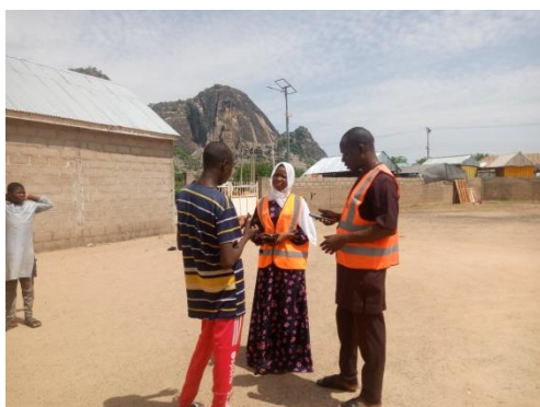
CEI conducted at temporary site of the Tsohon loko PHC